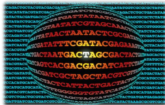
Allele base pairs

Parentage testing adds value to bulls as well. Many breed associations report that 10% of registrations are not correct. Most of these errors are due to simple record keeping mistakes, etc. When bulls are marketed with both the sire and dam having been qualified as potential parents, buyers have ensured confidence in the genetics they are purchasing.